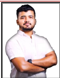
Chief Patron Hon. Dr. Jayant Patil Chairman, Shri Yashwant Shikshan Prasarak Mandal, Kodoli.